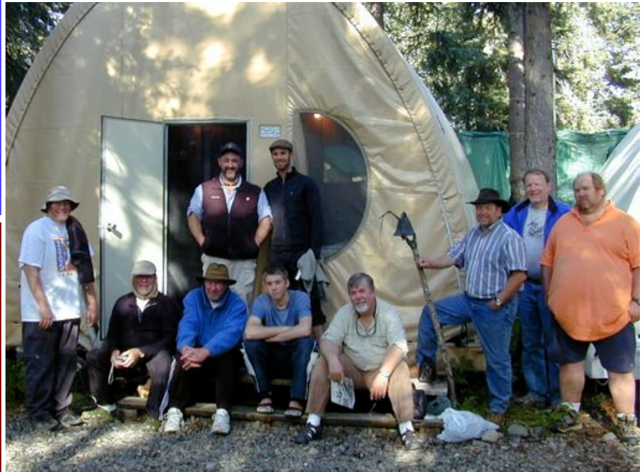
The OFF Tribe competes on "Survivor" Akaska

Olympic Fly Fishers P.O. Box 148 Edmonds, WA 98020