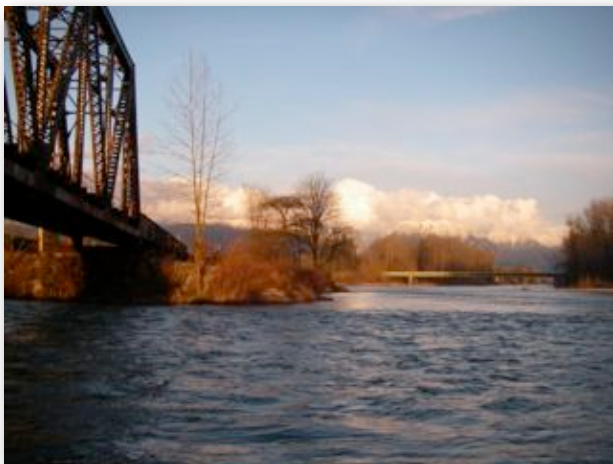
Railroad Bridge on the Skykomish near Sultan. The great thing about fly fishing is that it often leads us to beautiful places.

Someone mentioned that this is a difficult addiction to overcome once it takes control of a man. To their credit, those present felt that expulsion from the club was too severe and, in any case, would not help that member to overcome his problem. It was resolved to search the country for a 12 step program which could help him and an intervention then took place. This member rigidly denied the addiction, however, and a final resolution has not been reached.