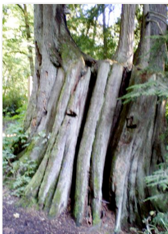
Old growth stump on trail.

New homes around the borders of the park are creating more runoff on an everyday basis and could create serious slide problems. Duane, along with residents in the area, are currently fighting a major housing development that could exacerbate the problem significantly.