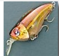
Our New Best Friend?

It was even suggested by one member on the trip that maybe the club should sponsor a bassmaster tournament. However, no one seconded the motion.