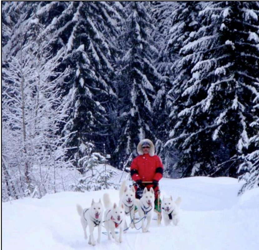
“ARE THEY BITIN’ TODAY?” Why snowshoe to the lake when you can drive your own sled team ? Capt. Larry Roxby teams up with “The Flying Furs” on a recent ice fishing run to Lost Lake near Stampede Pass. But alas, the ice was under five feet of snow. The dogs don’t seem to mind.

OFF fly tying classes bring out the best in all of us.