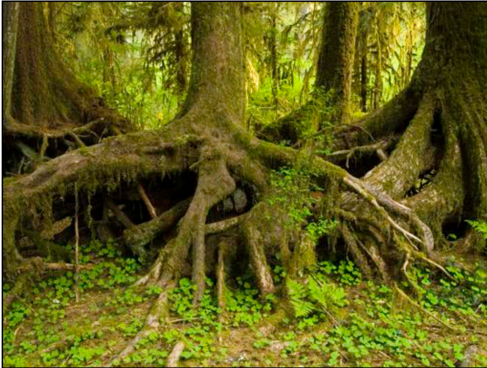
THE FALLEN NURSE TREES that once nurtured these Hoh Rain Forest spruce have long rotted away. But you still see their imprints in these roots that spread out around the ghosts of ancient trunks. Will the human imprint in the Hoh River Valley be as gentle? For the Hoh River Trust, the answer is a resounding "YES!"

Thinking long term? How about the Hoh River Valley in 200 years.