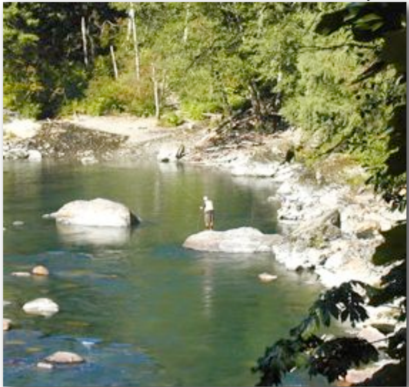
A “River Runs Through It” moment on the Snoqualmie.

Unlike the Yakima, the Snoqualmie doesn’t have regulated flows. So rocks that cover and protect food sources get washed out on a regular basis. That’s what makes Snoqualmie fish opportunistic and more likely to strike.