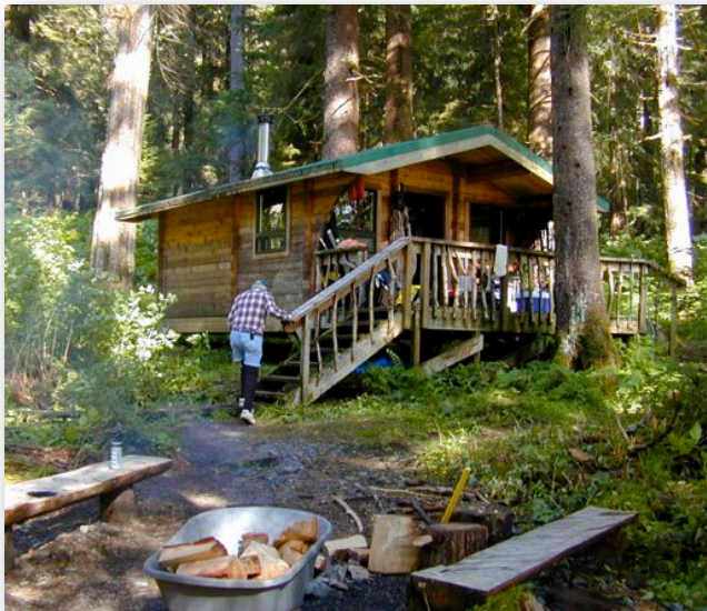
THE CABIN BUILT by the Forest Service was old, but sturdy and had some nice architectural details. Plus lots of firewood!

"Those guys could light a fire in a pouring rain."