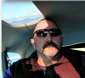
Nice place to fish!